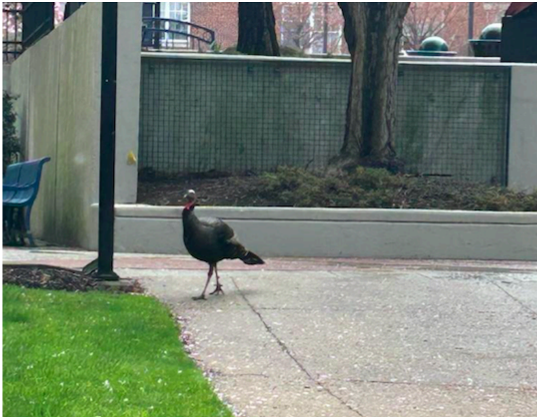
This turkey was strutting its stuff all over the quad!