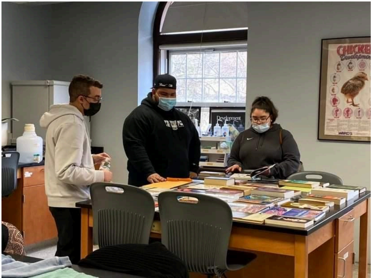
Students peruse materials on the environmental causes of birth defects at the Healthy Baby Awareness Day event on campus.