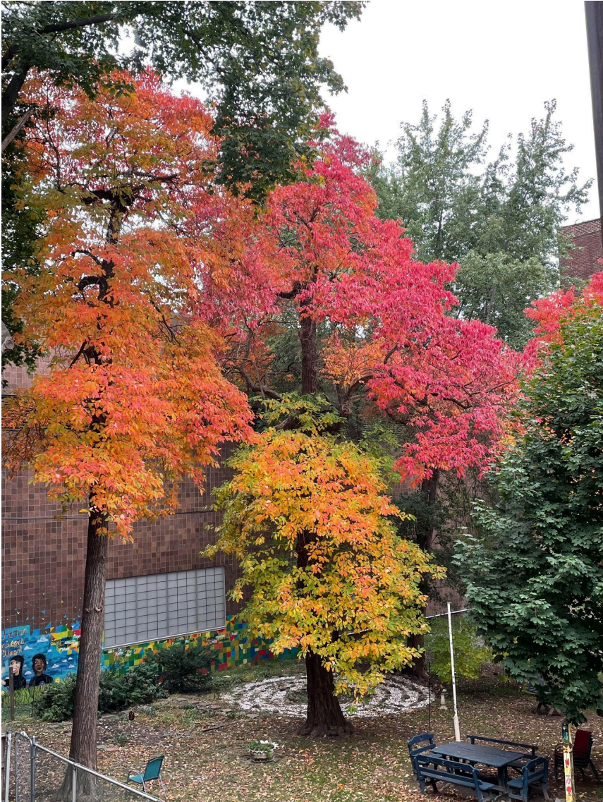
Fall foliage seen behind the houses on Glenwood Avenue.