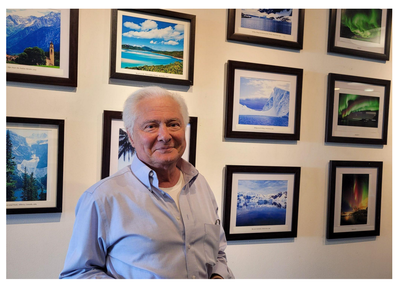
The photographs will be on display through Dec. 2, with a closing reception that evening from 5 - 7 p.m. The Fine Arts Gallery is located on the 5th floor of the Mac Mahon Student Center.

The goal of the exhibit is "to spread an awareness of, and appreciation for, our planet's fragile and endangered beauty," according to a press release.