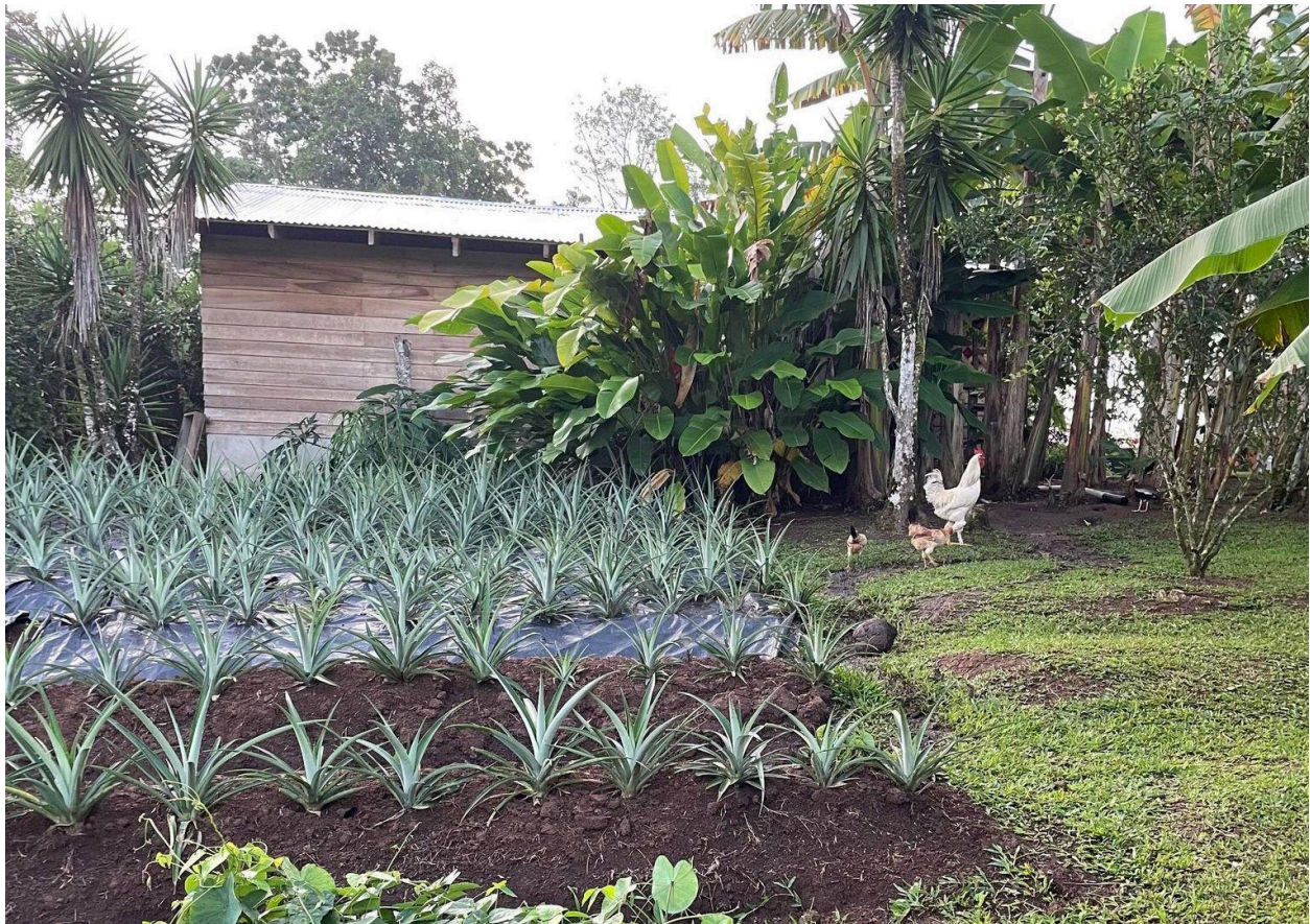
Organic pineapple is grown at the village of Juanilama in Costa Rica.