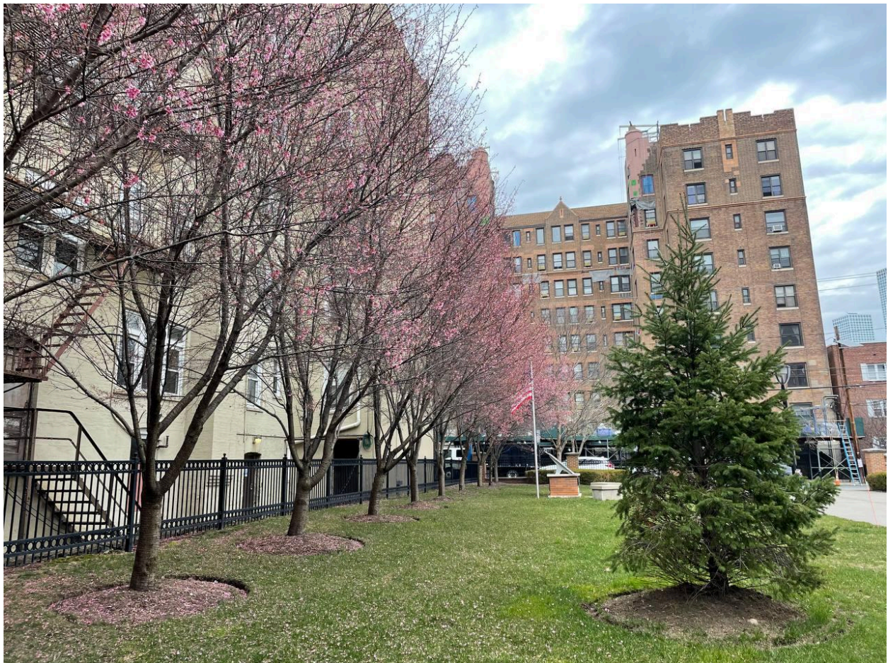
Beautiful pink buds on the trees outside the Mac Mahon Student Center.